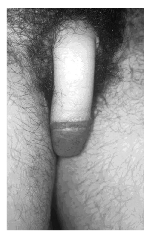
FIGURE 1. Phalloplasty, final result.